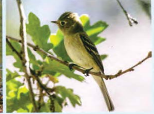
Cassin's vireo ( Vireo cassinii)