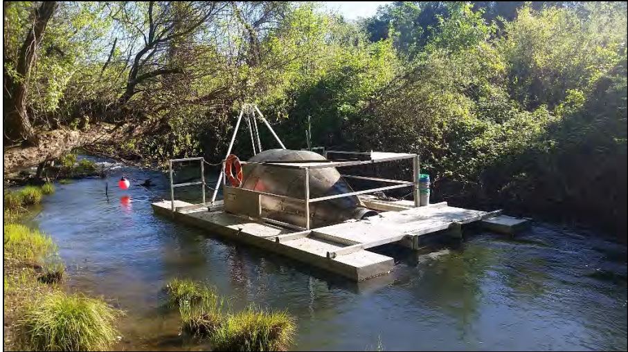
Figure 1. Napa River rotary screw trap