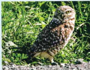
Burrowing owl ( Athene cucularia)