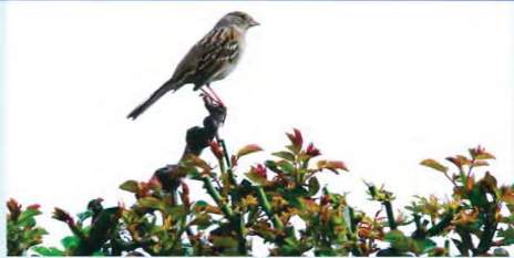
Sparrow sp. ( Zonotrichia sp.) Ann Seronello