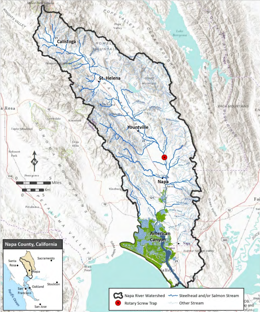
Figure 2. Napa River rotary screw trap location.