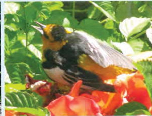
Bullock's oriole ( Icterus bullockii ) Karen Swain