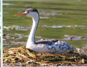
Clark's grebe ( Aechmophorus clarkii ) Don Wong