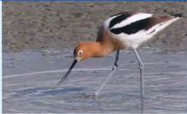
American Avocet ( Recurvirostra americana)