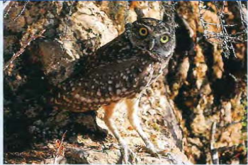
Burrowing Owl ( Athene cunicularia ) Jorgen Gulliksen