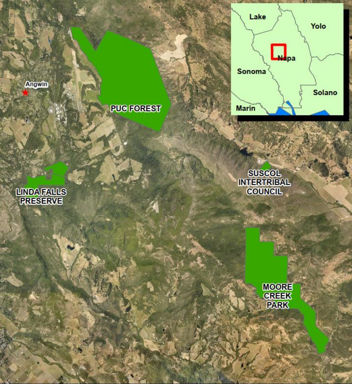
Coastal Conservancy Grant - Project Proposal Map Moore Creek Park - Linda Falls Preserve - PUC Forest - Suscol Intertribal Council Napa County, California