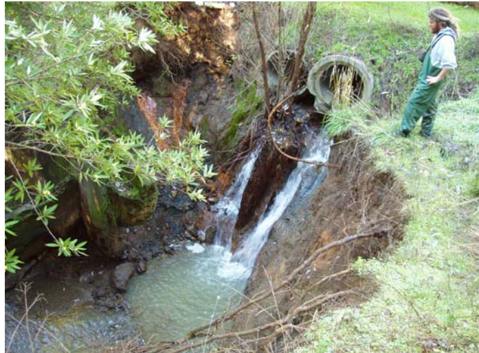
Figure 8: Examples of bank and gully erosion in the Carneros Creek watershed.