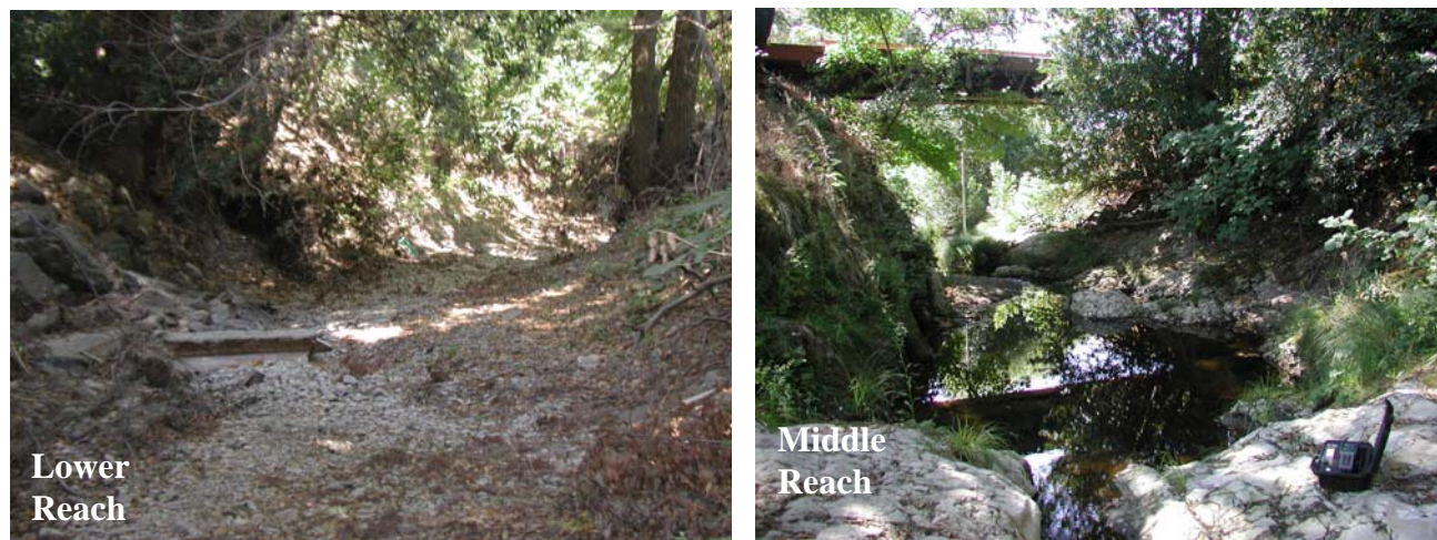
Figure 9: Images from the lower and middle reaches of Carneros Creek. July, 2004.

Napa County Resource Conservation District · 1303 Jefferson Street, Suite 500B · Napa, CA 94559 · (707) 252-4188 · www.naparcd.org