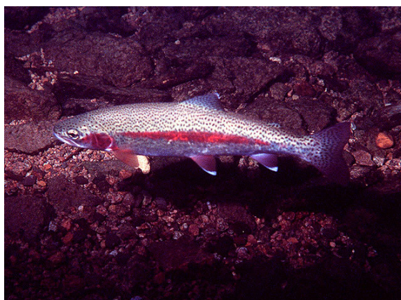
Figure 7: Steelhead Trout

The Carneros Creek watershed currently supports one species of salmonid, steelhead trout, which is a federally listed threatened species (Figure 7). Historical records go back as far as the mid-19 th century, when Menefee (1873: 36), described Carneros: “The writer has caught several [trout] that weighed from 7 to 10 ½ pounds, in the Carneros, five miles from its mouth, where the water was not a foot deep.” Although it is likely that Carneros Creek never supported an exceptionally large steelhead population, its relative importance, compared to other streams of similar size in the North Bay, has probably increased. This is due to the maintenance of fairly rural land uses, lack of complete migration barriers, and direct connection and relative proximity to the Bay.