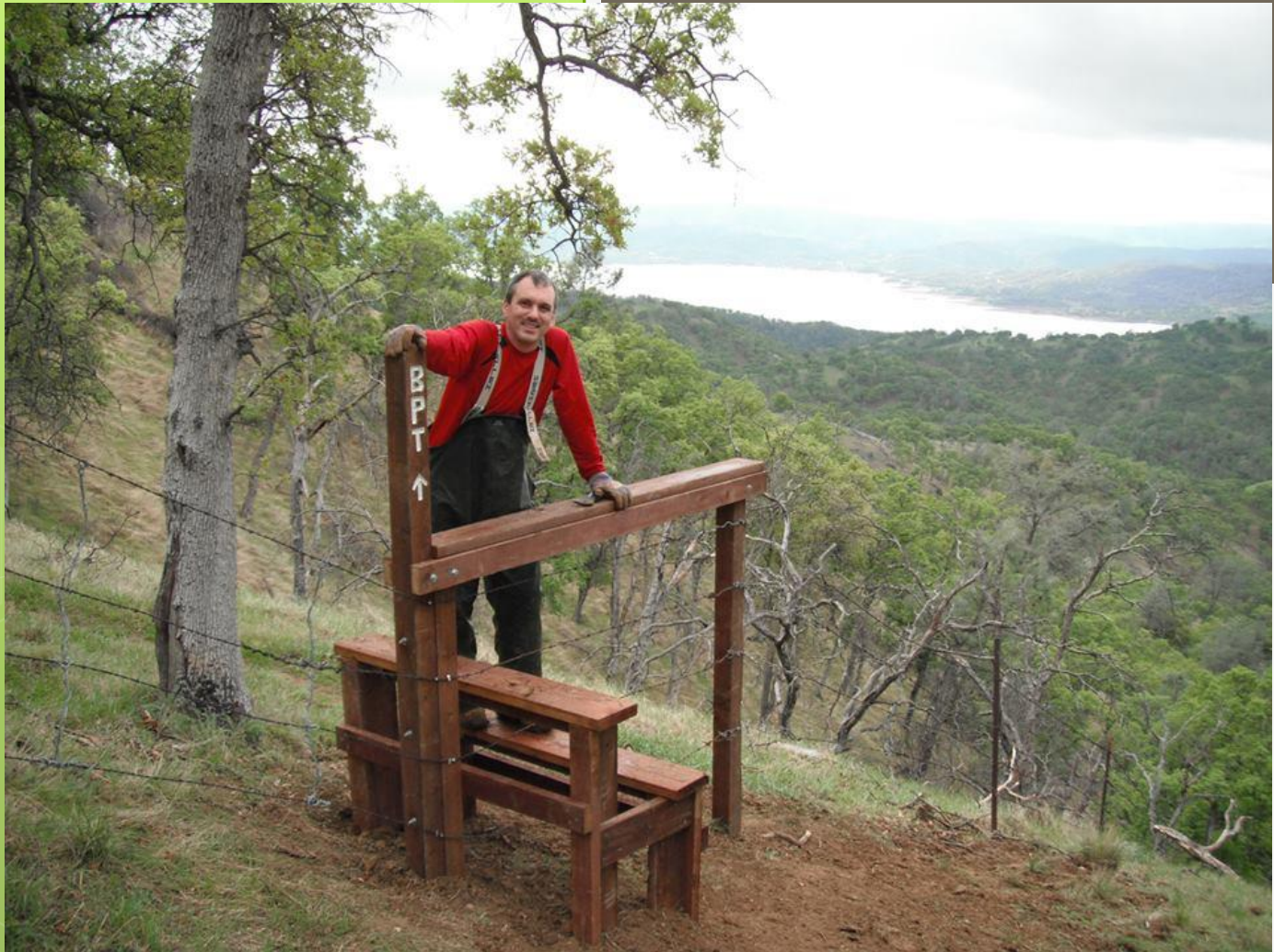
Tuleyome built a new stile on the Berryessa Peak Trail to improve ease of access.