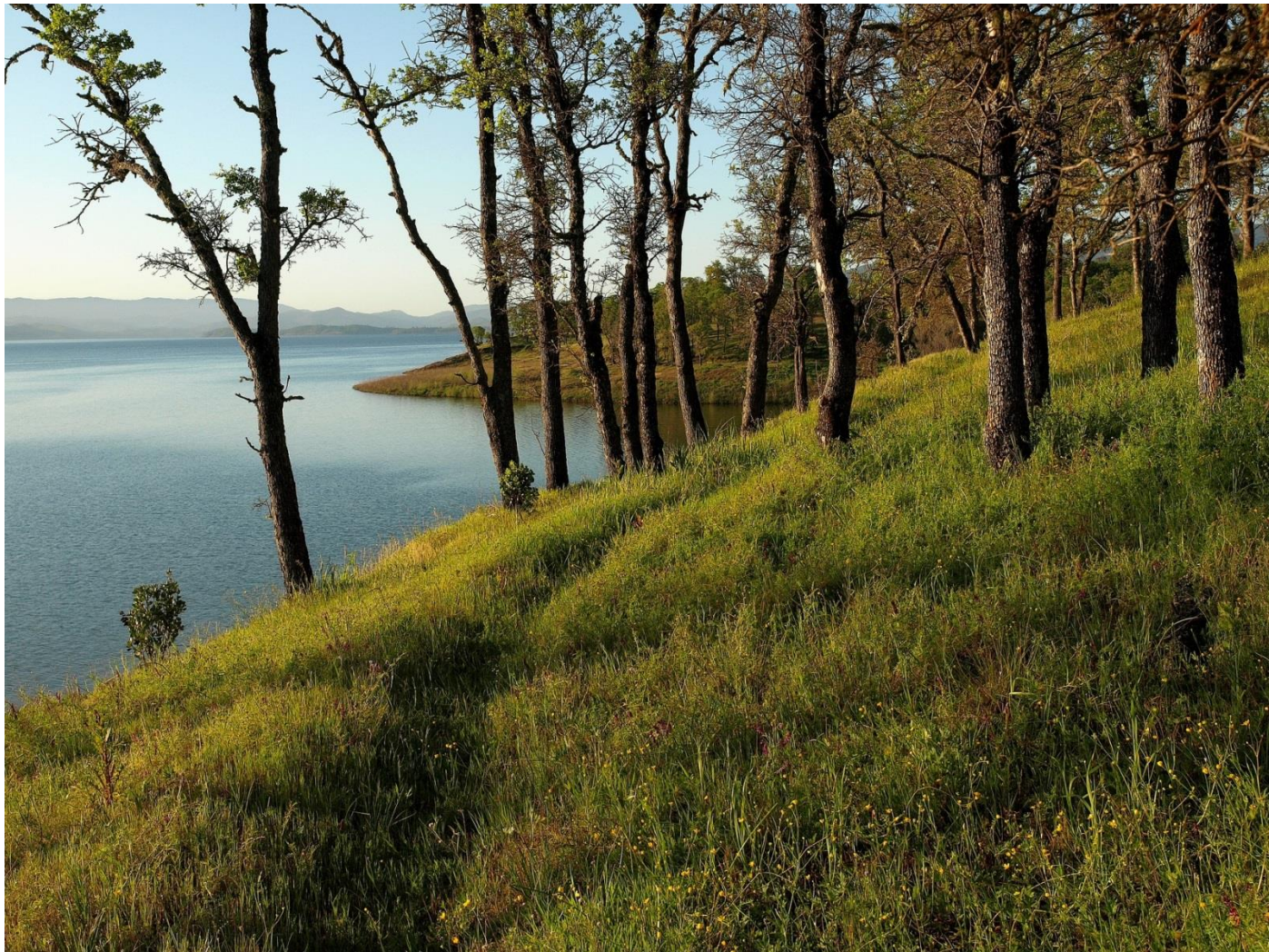
Oak Woodlands at the North End Trail