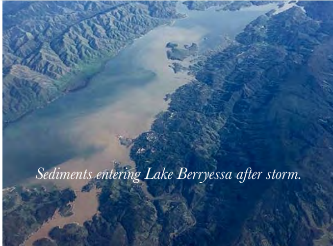
Sediments entering Lake Berryessa after storm.